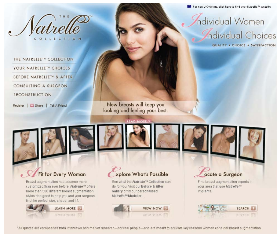
Figure 1. Using a unique, highly usable design, Rosetta enabled Natrelle to address the many motivations and blocks that women might have in selecting its breast-augmentation solutions.